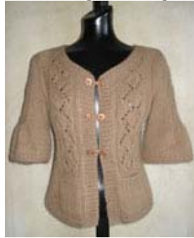
#70 Lush and Lacy Cardigan