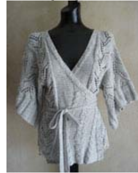
#69 Cables and Lace Kimono Wrap Cardigan

Visit www.SweaterBabe.com for the complete selection of Knitting Patterns, including the latest FREE patterns.