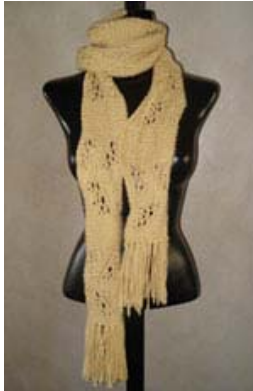
#68 Sinuously Curved Lace Scarf

Other SweaterBabe.com patterns you may like for your next project. . .